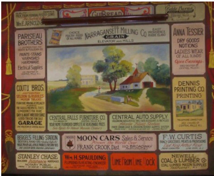
BVHS Advertising Stage Curtain

The striking stage curtain at BVHS was installed by Lime Rock Grange #22. According to a history of the Grange written in 1960, the curtain was hung in 1925, and touchingly adds “members have refused to part with it, even though the ads on it are out-of-date.”