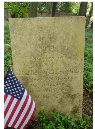
Fresh flag on the grave of Simon Whipple, Lincoln 15 on Great Road. Whipple fought in the Revolutionary War.