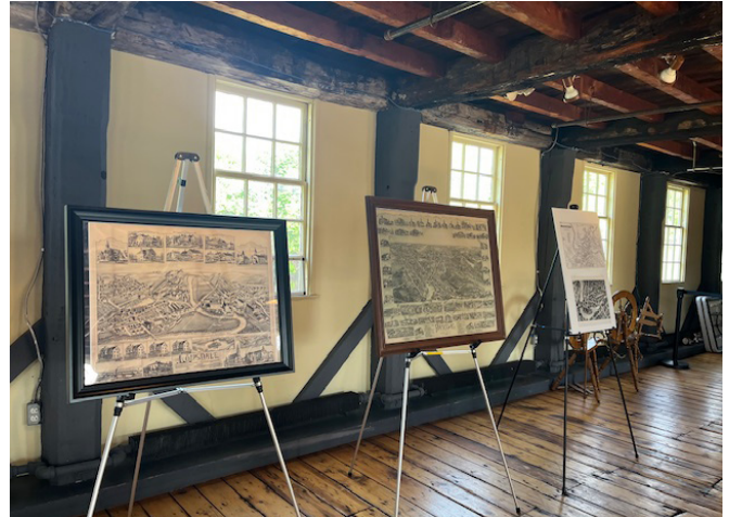
Maps from Providence to Worcester can be seen at the exhibit.

An exhibit featuring bird's eye view maps from the late 19th century of cities and towns along the Blackstone River is now on display on the second floor of Slater Mill. This exhibit was curated by Tim Wynne, a history student at Rhode Island College, interning at Slater Mill. Bird's eye maps are illustrated views that depict towns as if seen from above at an angle. While not usually drawn to scale, they show street layouts, individual buildings, and prominent landscape features. BVHS loaned its map of Valley Falls to this exhibit, which is free, and is open on Fridays and Saturdays in May, and from Thursday through Saturday this summer.