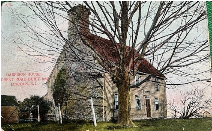
Postcard front and back

Alvin Schaut from Plainfield, Wisconsin, has sent BVHS a 1 cent postcard post-marked Central Falls RI, November 2, 1909, marked Garrison House, Great Road, built 1687. Although it probably depicts the Arnold House, it was also suggested that it may