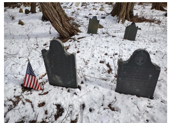
NP 12 on February 17