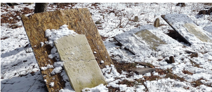
Broken stones pieced together during earlier restoration work at NP 12