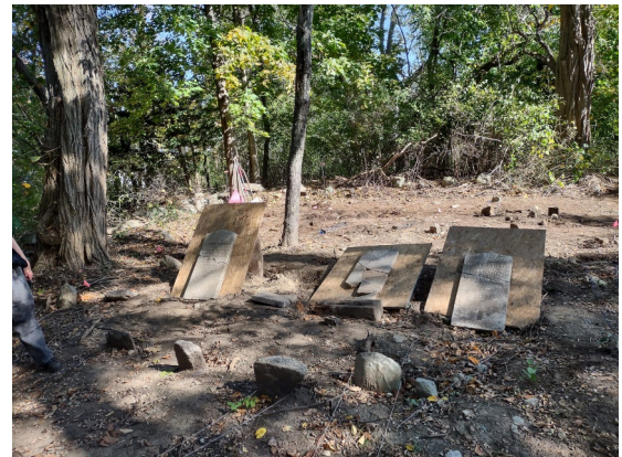
Broken headstones being pieced together at NP12, the Elena Street Cemetery in North Providence

tober 24 at the Old Diamond Hill Cemetery, CU024, an interesting cemetery with many 18th and 19th century graves. They plan to return in the spring as part of an ongoing project.