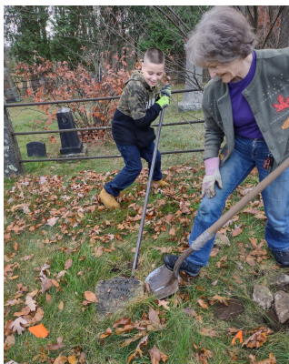
Volunteers uncover and lift a gravestone at the Millville/Wilson Cemetery on Nov. 5