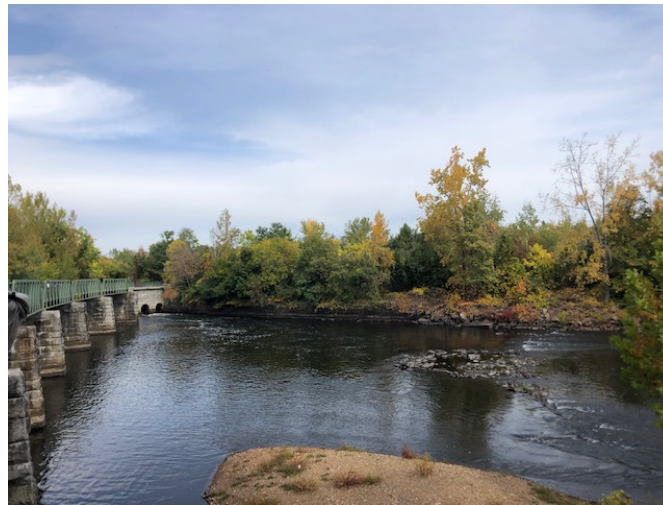
The Blackstone River in Lonsdale

The Blackstone River has been a lifeline to the people living in the Blackstone Valley throughout the centuries. It is a beautiful part of our heritage. As time has gone by, there have been many changes to the river, brought on mainly by humans, who used it as a dumping ground for hundreds of years.