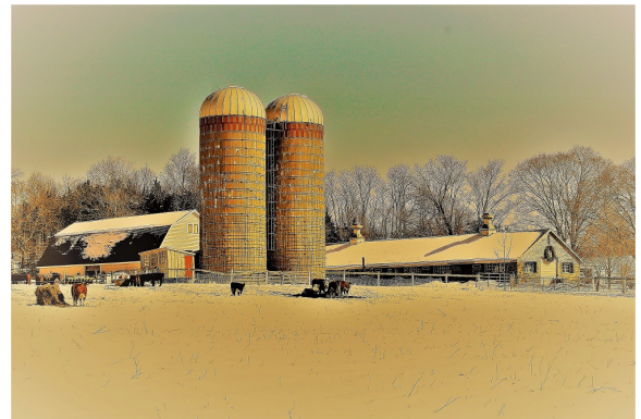
Chase Farm by Dan Bethel

10/14, 8:00 pm - Episode 5: The World According to Uncle Johnny (75 minutes)