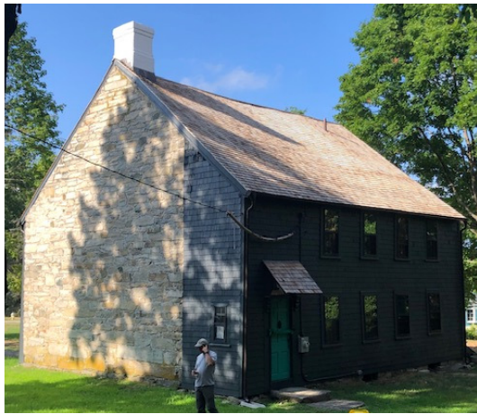
Valentine Whitman House

Renovations at the Valentine Whitman House at 1147 Great Road have been completed by Preserve RI, and a ceremony was held on August 10 to mark the occasion. Va-