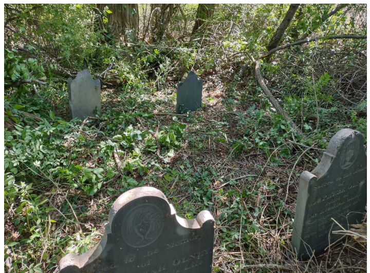
Underbrush trimmed from around stones