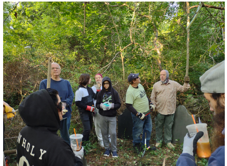
Volunteers pause during cleanup of the Hezekiah Olney Lot