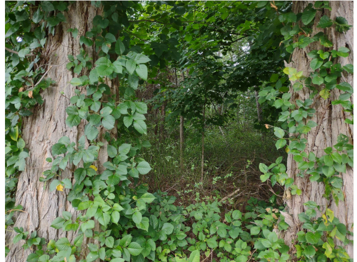
Is there a cemetery in there?