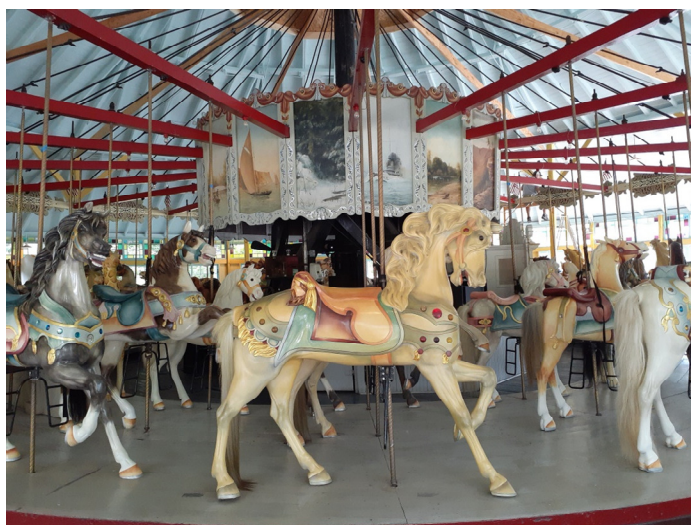
The Loeff Carousel, moved to Pawtucket in 1910, is open again after a $2.5 million restoration.

In the early 1900s, the initial work was begun to create paths, drives, ponds and bridges, making the previously unreachable areas of the park accessible to the walking and motoring public. The Daggett House was preserved