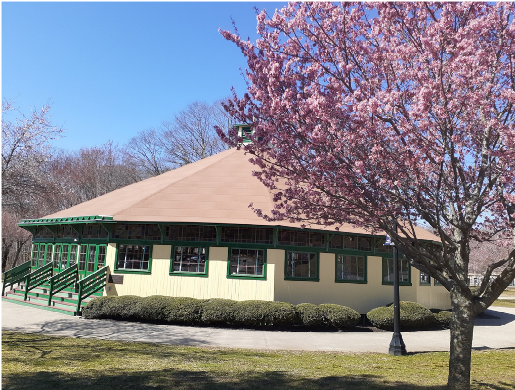
The Loeff Caroussel won the “Historic Carousel of the Year” Award in 2018.