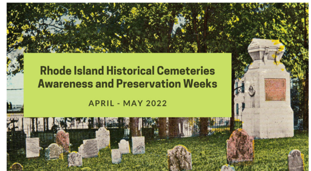
RI Historical Cemeteries Awareness and Preservation Weeks See activities at: https://preservation.ri.gov/ricw-calendar

Among the activities planned will be a tour of the Mineral Spring Cemetery on 10:30 am on April 30. A cleanup is planned at the Union Cemetery Annex in North Smithfield on May 21. Cleanups are proposed but currently unscheduled at the Kimball Lot in Cumberland, the Lydia Harris Lot in Lincoln, the Peach Hill Cemetery in North Providence and at several locations in Woonsocket.