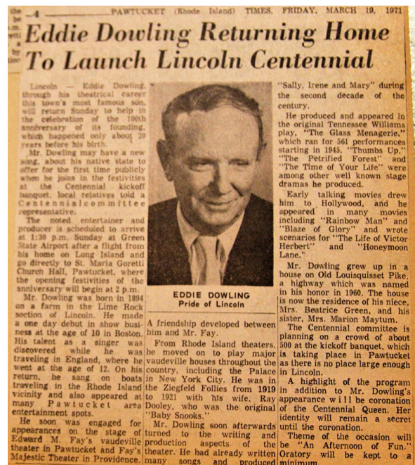
The exhibit includes this newspaper clipping from the Pawtucket Times, March 19, 1971.