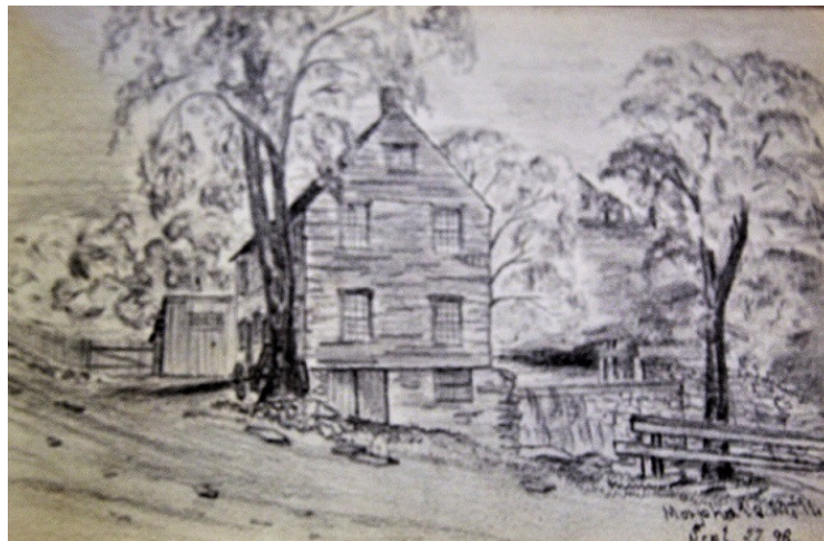
Sketch of Moffett Mill dated Sept. 27, 1896. Collection of Dan Bethel

The Moffett Mill exhibit will give a comprehensive look at the mill, a machine shop throughout most of the 19th century, that produced wagons, carriages, wooden boxes, shoe laces, and other tools used by local farm-