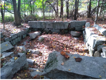
Greg Duhamel and Zachary Cote cleaned this cellar hole near the Zebina Cook Cemetery.

Greg Duhamel and Zachary Cote have been clearing trash and brush out of the cellar holes and