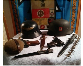
Pieces from Heskin's Collection

We are working on new exhibits for 2021. We wish all a happy and safe Thanksgiving and holiday season.