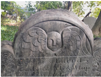
Angel headstone at Lincoln 15.

(continued from p. 1) A cleanup is planned for November 14, starting at 8:30 am. The Lincoln Conservation Commission may be helping out with leaf bags and gloves, but