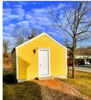
Arnold's Lonsdale Bakery

The Blackstone Valley Tourism Council will be doing a redesign of the Great Road Map,