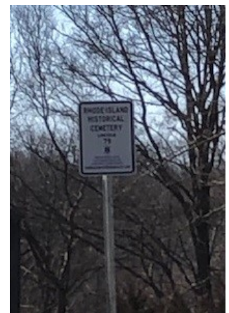
Cemetery 79 Sign on Great Road

ing historic graveyards. Ken Postle raised the visible stones several years ago. The late Gagne, then 98 years old, gave him permission to try to recover some of the lost stones. Read more in the Valley Breeze article: www.valleybreeze.com/2020-02-12/cumberland-lincoln-area/lincoln-family-hopes-restore-burial-grounds