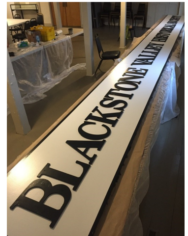
The completed sign