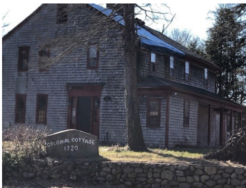
Walcott House in Cumberland. Tarp still covers roof damage where a tree fell on the roof in 2018.