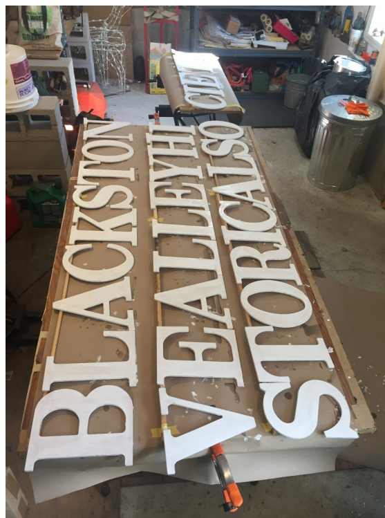
Letters before painting