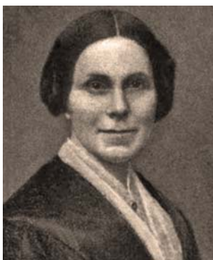
Elizabeth Buffum Chase