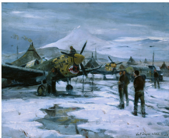
"Tired Tigers-Umnak-Alaska" 1942

born in Hopedale, MA, in the Blackstone Valley. His family developed and patented numerous improvements in textile machinery throughout the 19th and ear-