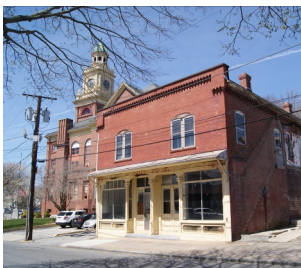
Town Hall Historic District.

(continued from p. 1) The Valley Falls Company Store, built ca. 1890, was the Post Office and Valley Falls Free Library from the 1890s to the 1920s, and was a grocery store from the 1920s to 1988. The two-story commercial building has fine wood framing around its glass storefront windows.