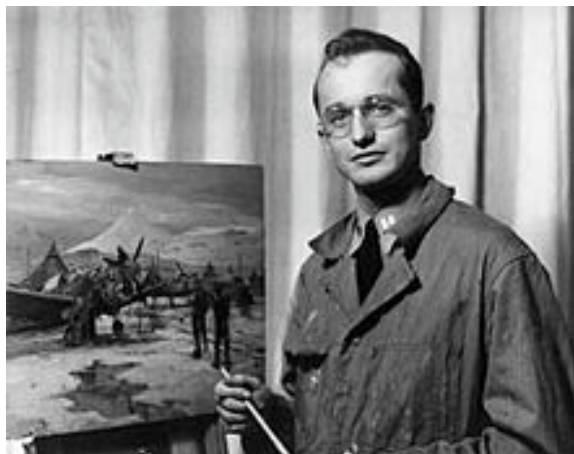
William F. Draper Photo from Wikipedia

The Rhode Island Historic Preservation and Heritage Committee has just announced that the Cumberland Town Hall at 45 Broad Street, the former Valley Falls Post office and Library at 16 Mill Street and the statue commemorating Cumberland's war dead have been designated the "Town Hall Historic District" and have been placed on the National Register. The Town Hall, a 3-story colonial revival style brick structure with a wooden clock tower, was designed by Rhode Island architect William R. Walker and built in 1894. (continued on p. 2)