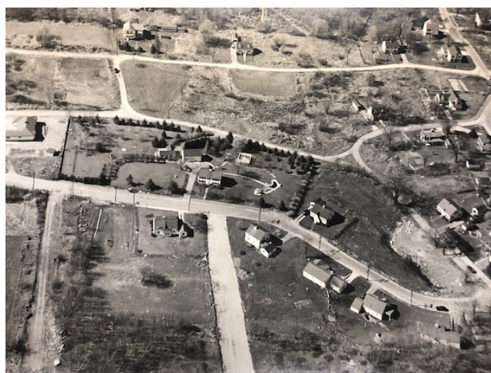
Aerial photograph of Saylesville Highlands

The Bicentennial Quilt given to the Society by the City of Pawtucket will be hung downstairs. The quilt blocks were made by different quilters and feature landmarks around the Blackstone Valley, such as Lincoln Woods, the Monastery, the Moffett Mill, and Slater Mill. A chart of the scenes and the known quilters will be displayed next to the quilt. BVHS welcomes any additional