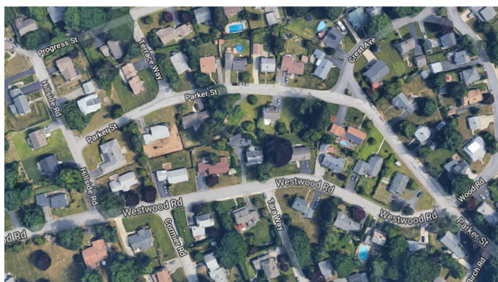
Area from Google Maps

information about the quilt and its makers.