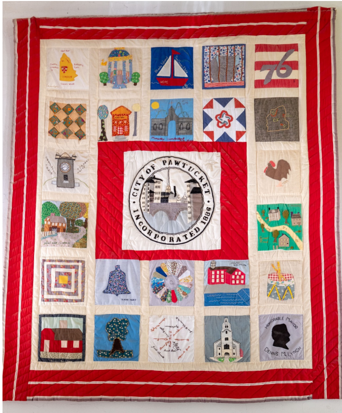
1976 Pawtucket Quilt