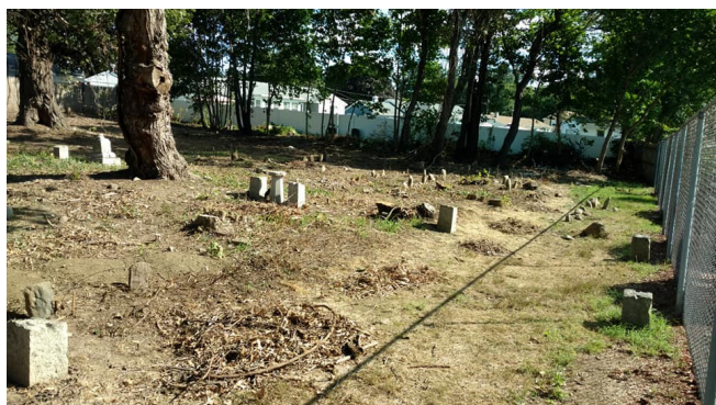
North Providence Historical Cemetery 09 (NP09) August 24