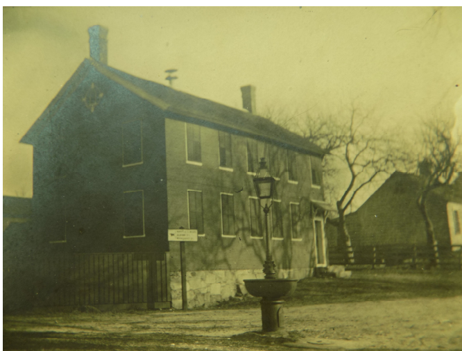
Mount Moriah Lodge and Lime Rock's Public Water Fountain