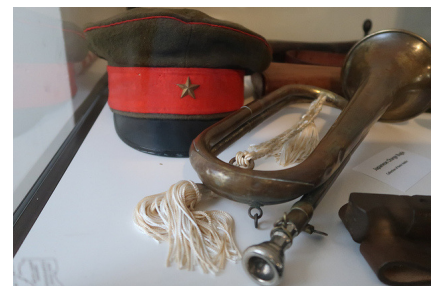
WWII Exhibit on Feb 24.

Tickets: Available soon www.brownpapertickets.com/event/4105521 and also at the door.