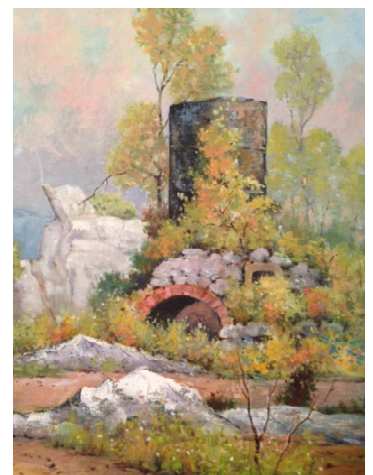
"Stephen Wright" Kiln, Conklin Lime Quarry