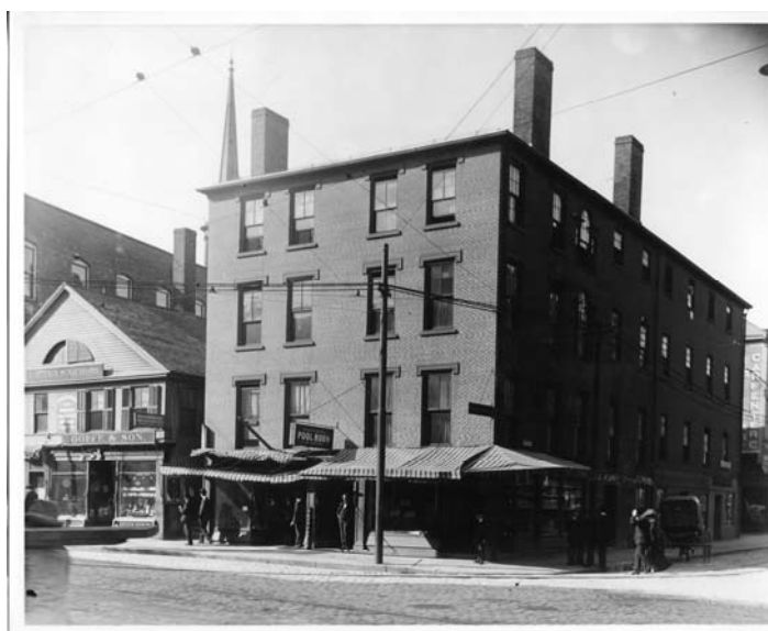
Dorrance Building 1904

Jocelyn Spas, an intern from Bryant College, worked with BVHS member Pat Armitage all last fall to scan and record photographs from the BVHS's Foster Collection, which contains many historic images of Pawtucket. The picture at right shows the Dorrance Building on the corner of Main and North Main Street about 1904. We hope to share more of these pictures soon.