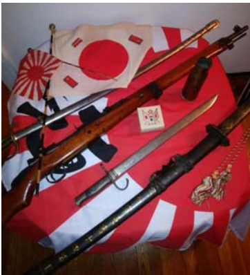
WWII era weapons and flags