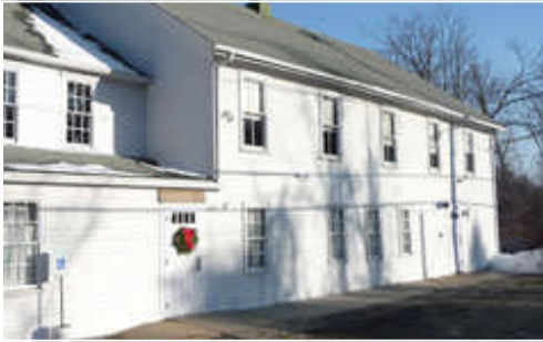
Before Renovations ↑