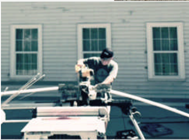
Working hard ↑

Basement access doors have been rehung and primed.