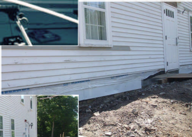
Sill work almost done ↑

After the building sill repair work is completed, the walkway will be graded and a new cement walkway poured.