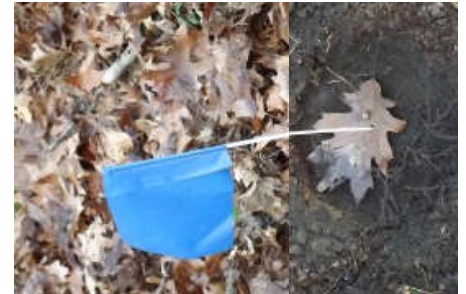
Just one of many artifacts unearthed at the Nipsachuck Swamp site.