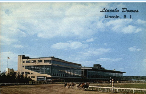
Lincoln Downs Lincoln, R. I.

When you go to Twin River nowadays, you might forget that this part of Lincoln has been through several changes, but, if you look around the property, you might catch glimpses of the original, Lincoln Downs, which still is there, in both spirit and buildings.