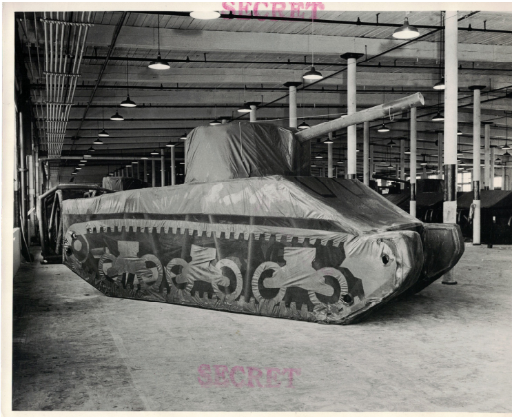
Top secret Inflatable tanks like this one were made in Woonsocket.