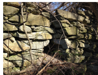
Exhibit at North Gate

Museum of Work and Culture, 42 South Main Street, Woonsocket, RI. For more information, see www.rihs.org/mowc-programs/