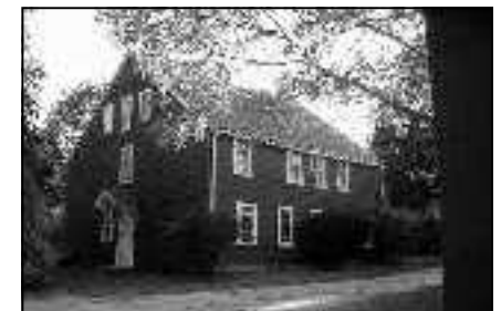
Valentine Whitman Jr. House