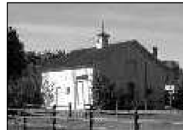
Hannaway Blacksmith Shop