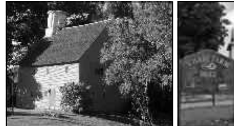
Eleazer Arnold House and Chase Farm