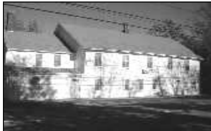
North Gate, Arnold Bakery & Buckley Building

* An unusual display of 19th century bird's eye views/ panoramic maps, placed end-to-end depict mill villages from Providence to Worcester. Exhibit suggests a balloon ride perspective 150 years ago.