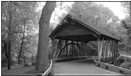
Lincoln Woods State Park

Presented by the Great Road Collaborative