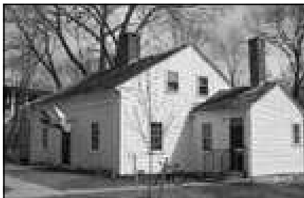
Captain Wilbur Kelly House Museum