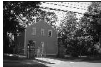
Saylesville Quaker Meeting House