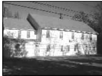
North Gate Toll House

A museum, located next door to North Gate in the former Lime Rock Fire Station , features items relating to the history of the Lime Rock Grange, Lime Rock Volunteer Fire Department and lime stone industry.